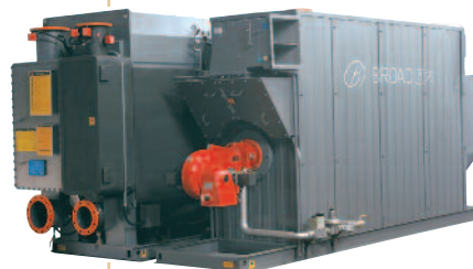
Direct fired gas chiller system.

Steam turbine-driven chillers are applicable to large tonnage systems with an existing source of steam to meet process and space conditioning cooling requirements.