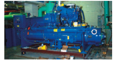
Hartford YMCA chiller system.

Steam-turbine drive cooling uses medium pressure steam (usually 100 to 200 psig) to turn a compressor. The compressor provides the motive force for the traditional refrigerant vapor compression cycle. Similar to the absorption cooling process, useful cooling is generated in the evaporator. Heat is rejected in the refrigerant condenser to