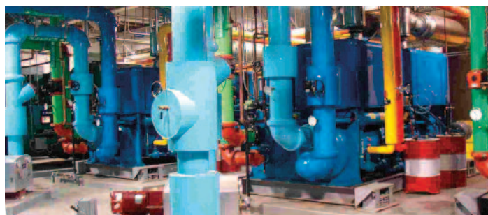
Several installed chillers.