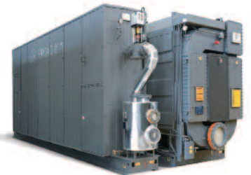
Steam double natural gas chiller system.