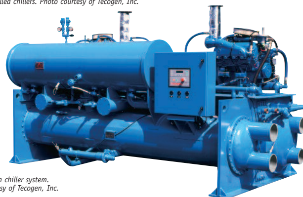
Engine driven chiller system.